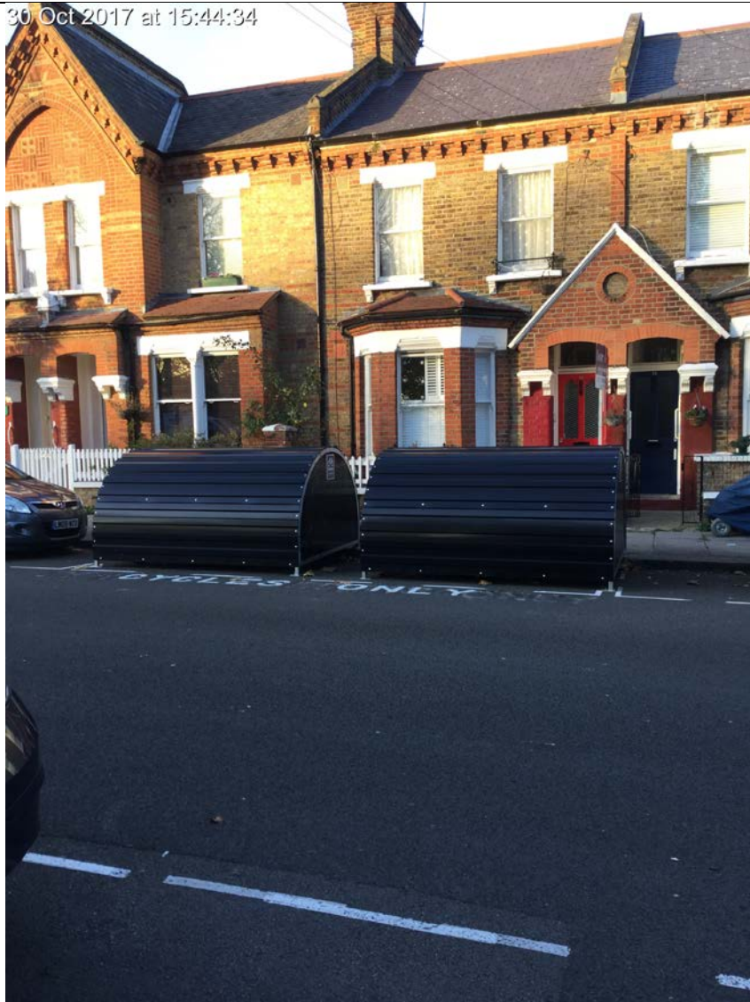
Bike hangars in place outside 18 Ilbert Street